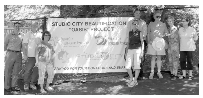
Banners acknowledge those who put much effort into the Oasis project. The Studio Clty Beautification Association is moving forward towards completion.

<u>Book Sale:</u> Saturday, August 29, 2009 from 10:00 a.m. - 2:00 p.m. Please bring bags or boxes for purchases.