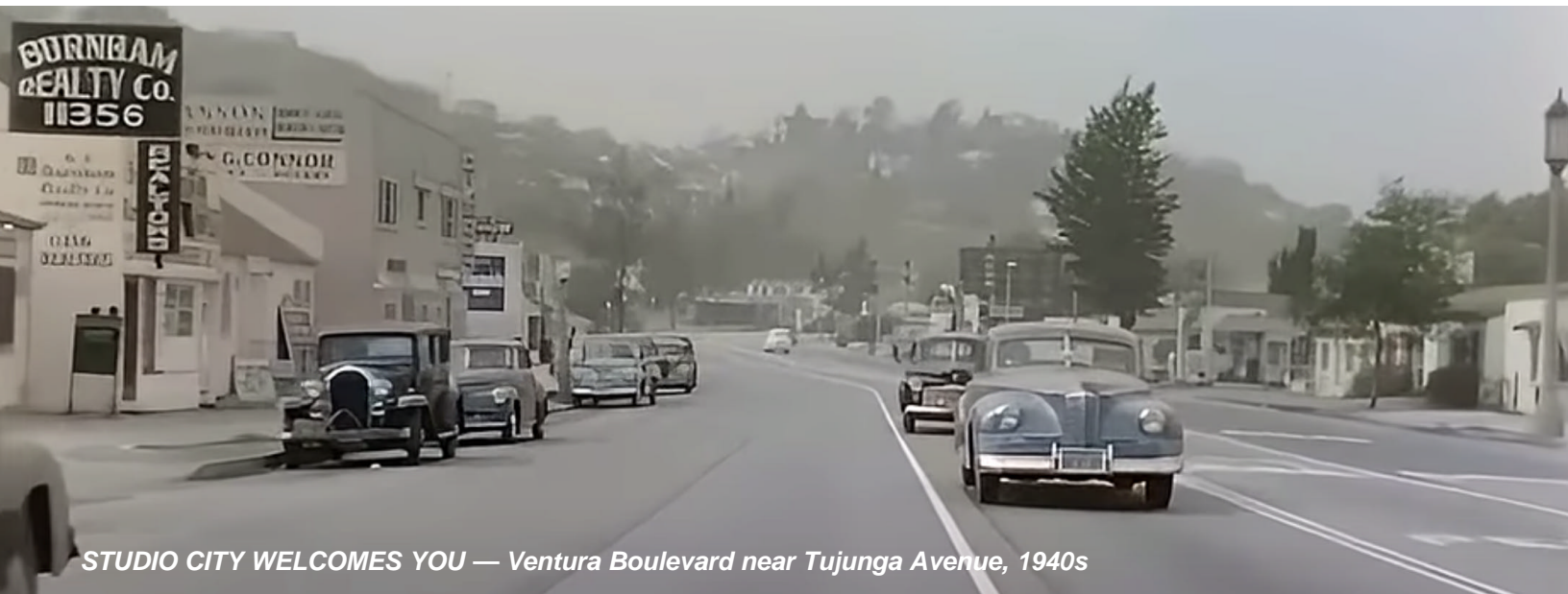
STUDIO CITY WELCOMES YOU — Ventura Boulevard near Tujunga Avenue, 1940s